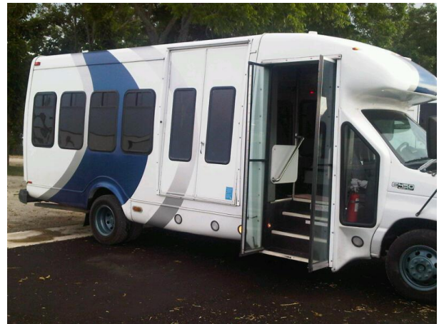
As you can see by the pictures the vehicle is in great shape and only has 131,000 miles, not bad at all for a diesel engine!

..... We were informed by the HNS Board that we would no longer be able to use their vehicles for any type of transportation. Our Community Catalyst obtained a $13,000 grant from the Family Service Association for the purchase of a vehicle that will be used for various HOT and PEACE PAL activities until the end of August. After August it can be used by DRY, DR, HEB camp, etc. Dee, Roberto Tudon and Bubba went shopping and found a vehicle in New Braunfels. Dee was able to negotiate the sales price down to $25,584.54 It is a 2005 Model that will seat 14 passengers and 1 driver. This is the maximum number of passengers that can be transported without the driver needing a Commercial Driver's License. It has a wheelchair lift that will come in handy when transporting seniors who have a hard time walking up the stairs in the vehicle. The Church is responsible for the $12,584.54 balance, which will come from Interest Dividends of the $1.2 million endowment